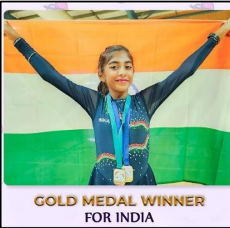
GOLD MEDAL WINNER FOR INDIA